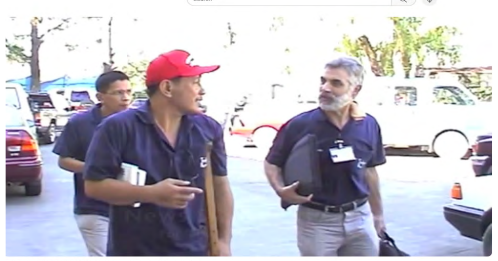
bood News Systematic Theology For The Philippines Part 2