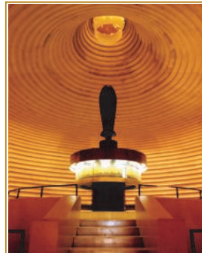
Dead Sea Scrolls display inside "The Shrine of the Book" museum, Israel