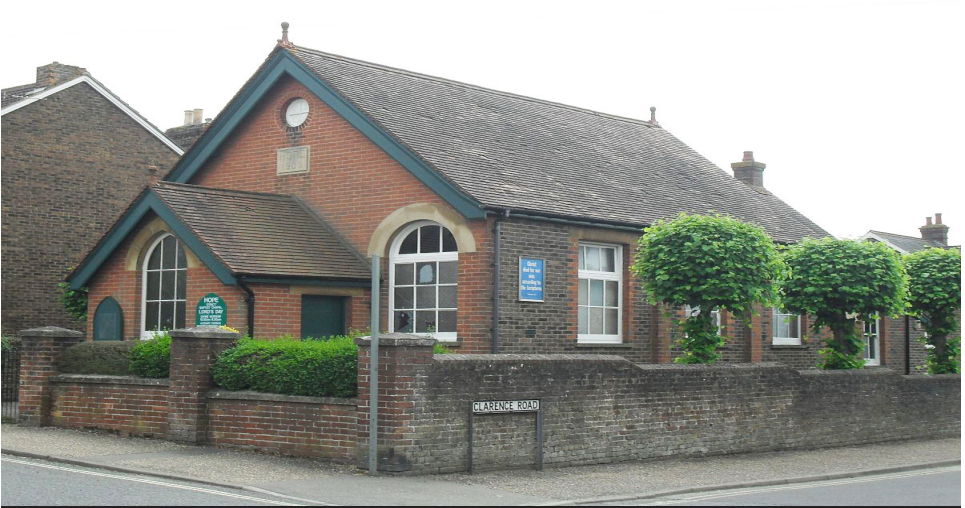
Hope Chapel Horsham