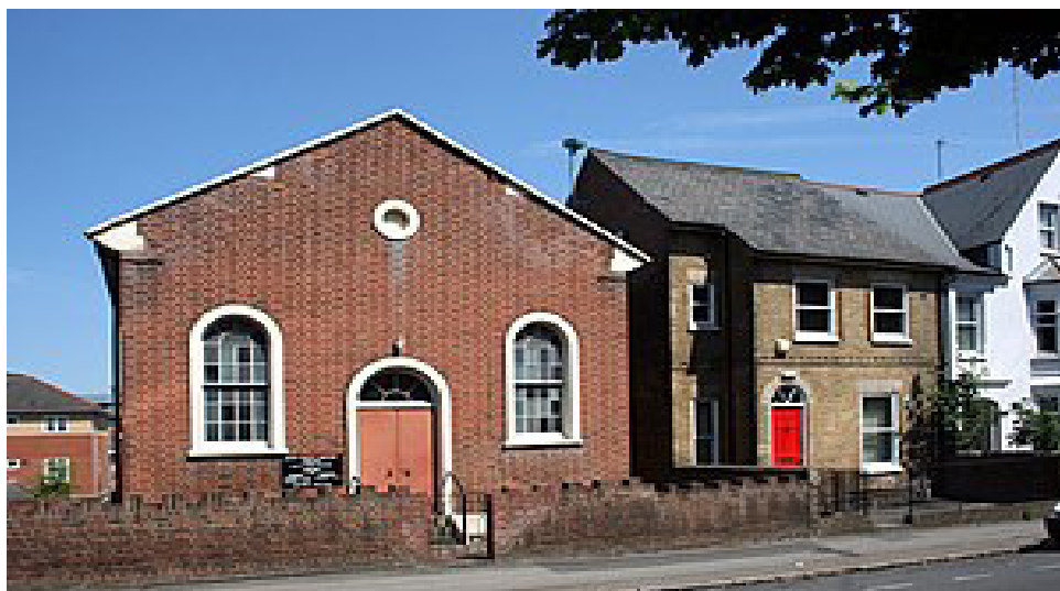
Zoar Chapel Reading