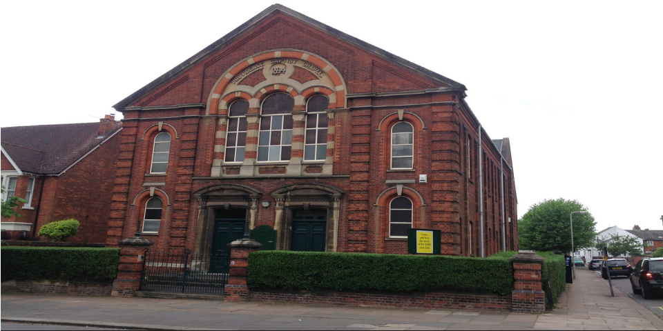
Providence Chapel Bedford