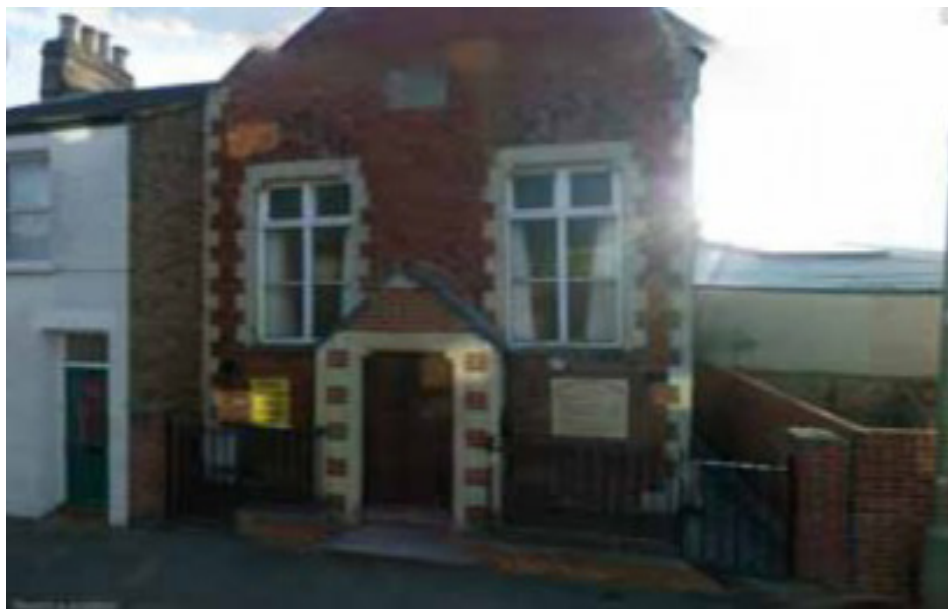
Hope Chapel Oxford