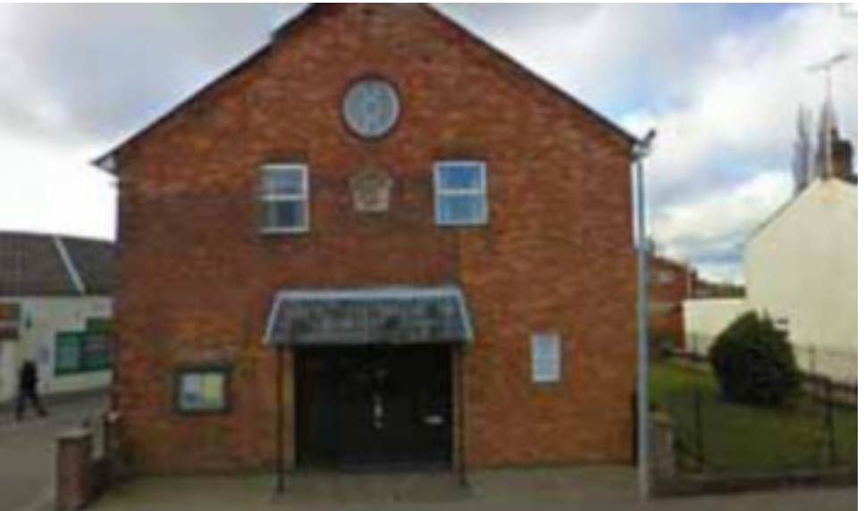
Eaton Bray Chapel