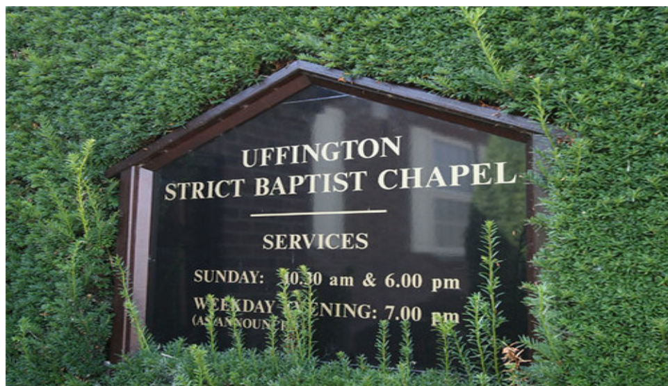
Uffington Strict Baptists Chapel