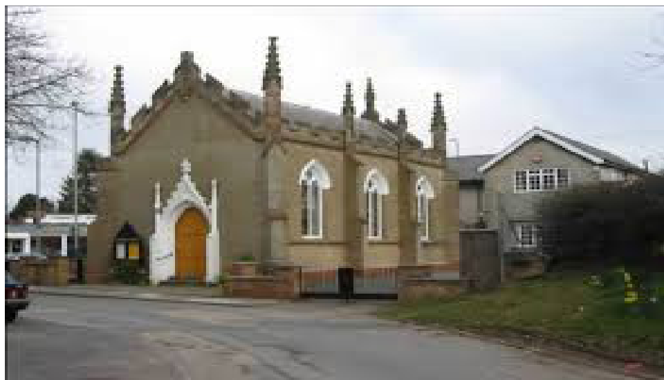
Evington Chapel Leicester