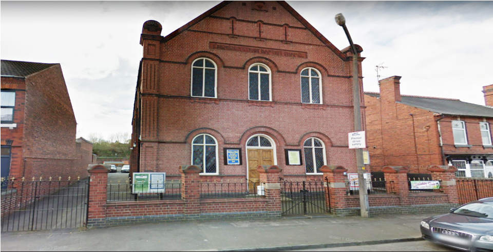
Ebenezer Old Hill, Cradley Heath, Black Heath