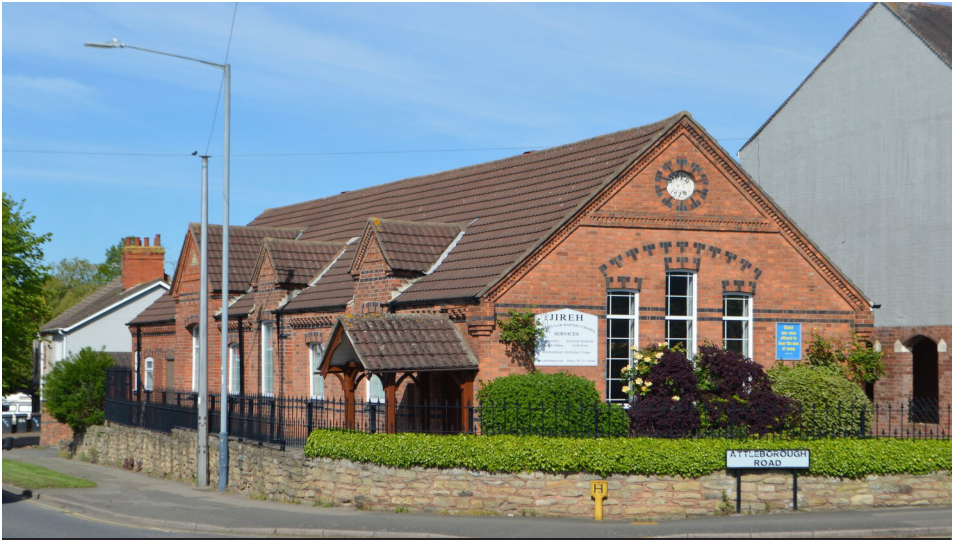
Jirah Chapel Nuneaton