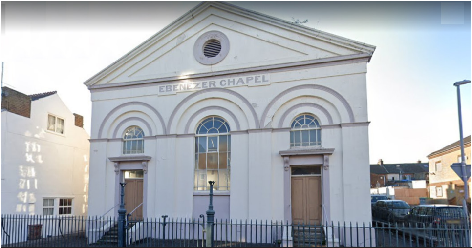
Ebenezer Chapel Luton