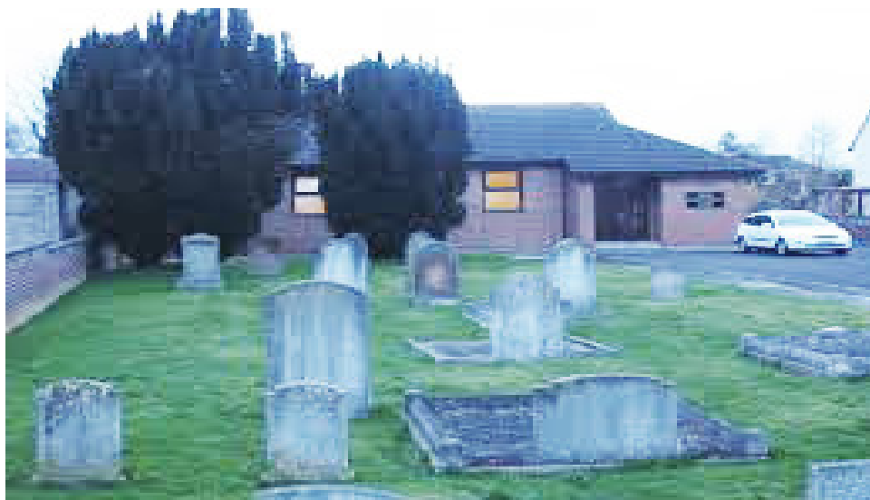
Grove Chapel Wantage