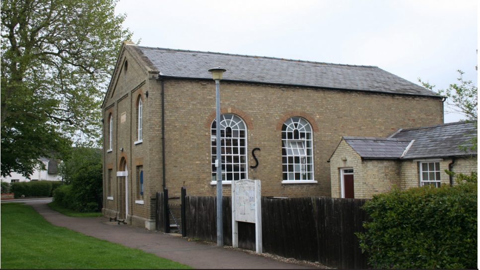
Oakington Strict Baptists