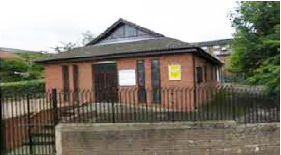
Hope Chapel Nottingham (New Chapel)

The Deacon of the Church at Nottingham when they were in the old build-