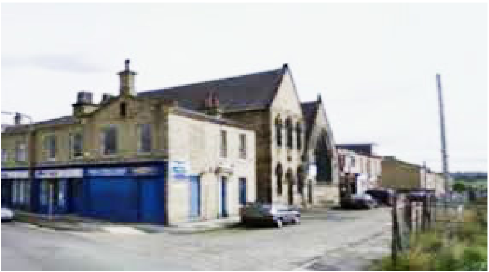
Darefield Street Chapel (Old Building)