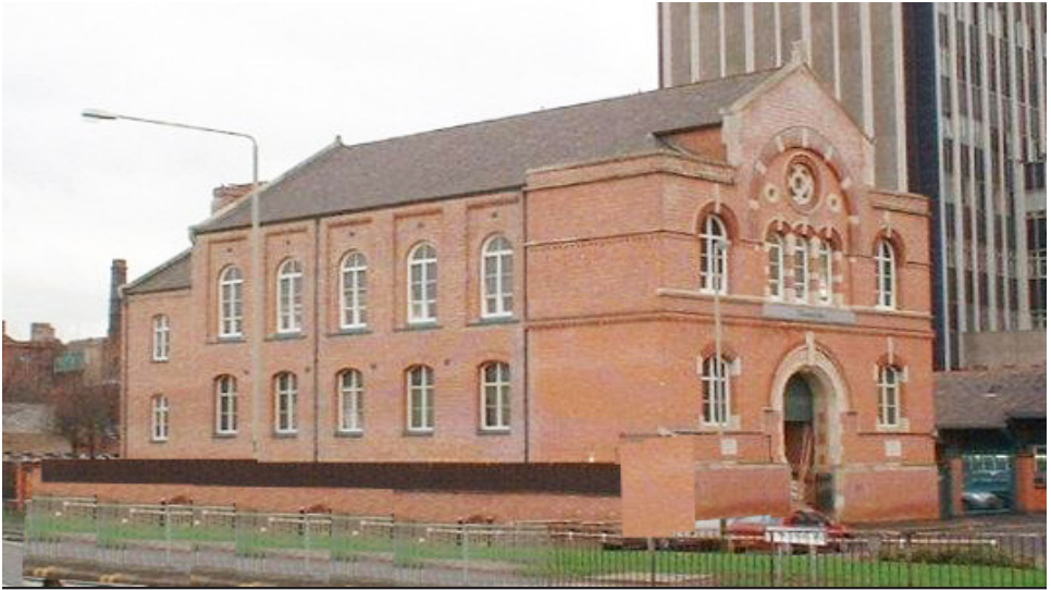
Zion Chapel Leicester